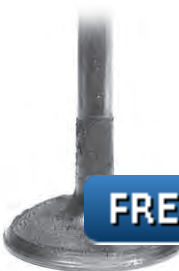
Intake Valve after P.i. Treatment