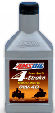
AMSOIL 0W-40 Formula 4-Stroke® Power Sports Synthetic Motor Oil