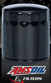
AMSOIL E3 FILTERS