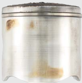
SABER Professional @ 100:1